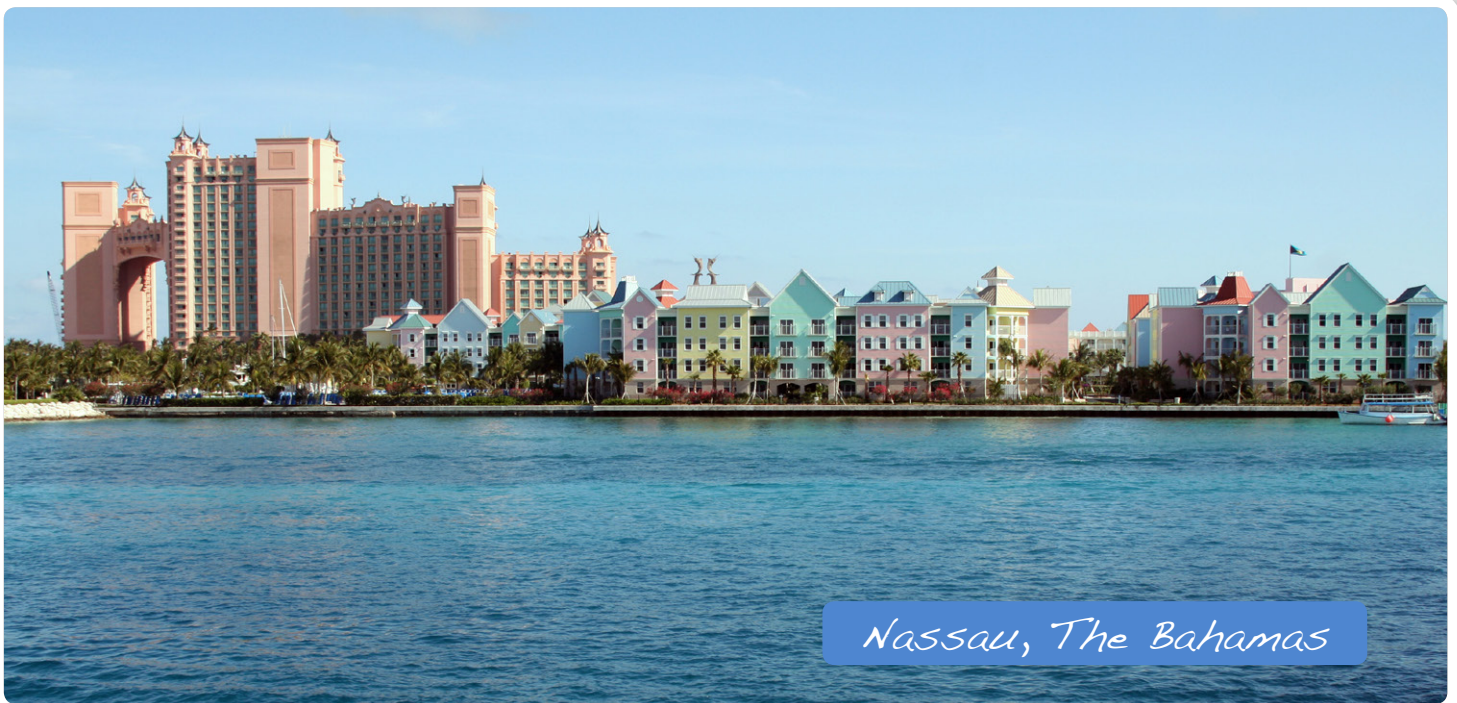
Nassau, The Bahamas