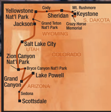
Yellowstone National Park

GRAND CANYON NATIONAL PARK, BRYCE CANYON NATIONAL PARK, ZION NATIONAL PARK, GRAND TETON NATIONAL PARK, YELLOWSTONE NATIONAL PARK