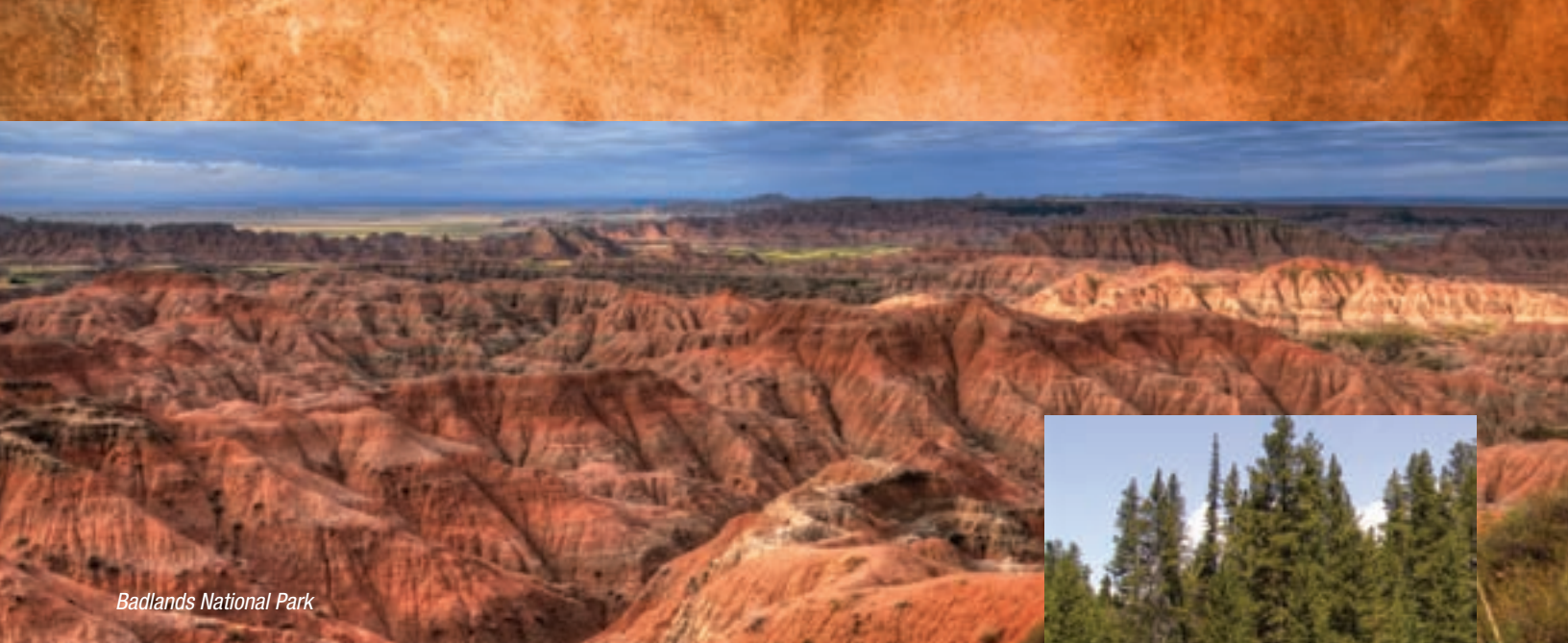
Badlands National Park