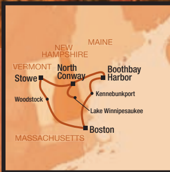
New England Fall Foliage

BOSTON, WOODSTOCK, STOWE, NORTH CONWAY, LAKE WINNIPESAUKEE, BOOTHBAY HARBOR, PORTLAND, KENNEBUNKPORT