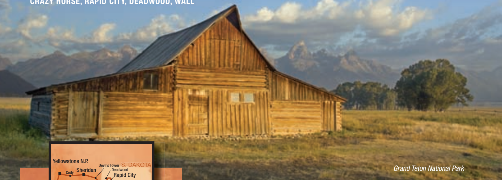
Grand Teton National Park

JACKSON HOLE, GRAND TETON NATIONAL PARK, YELLOWSTONE NATIONAL PARK, CODY, SHERIDAN, CRAZY HORSE, RAPID CITY, DEADWOOD, WALL